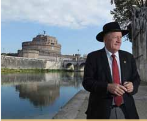
Tim with the recognisable Akubra beside the Tiber

CEF Ambassador, The Hon Tim Fischer AC, has generously committed to donating a percentage of the proceeds from sales of his latest book, Holy See, Unholy Me , to assist our work in rural Australia.