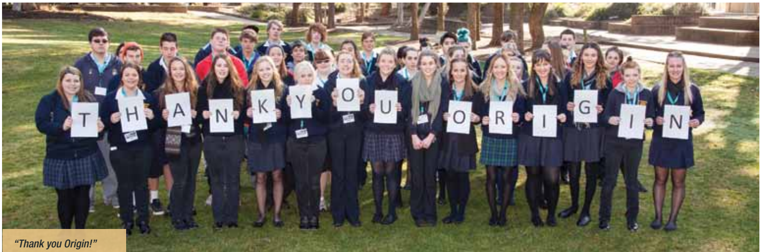
"Thank you Origin!"

A big thank you to the Origin Foundation which also helped make this experience possible.