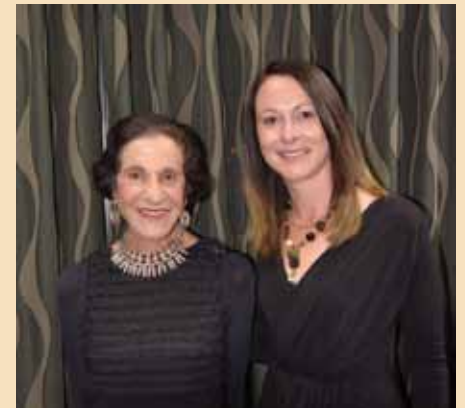
Marie Bashir at the Edward River fundraising dinner

Thank you to all who attended and to the businesses who supported the evening with sponsorship and auction items. Nearly $5000 was raised to help future students from the Edward River region.