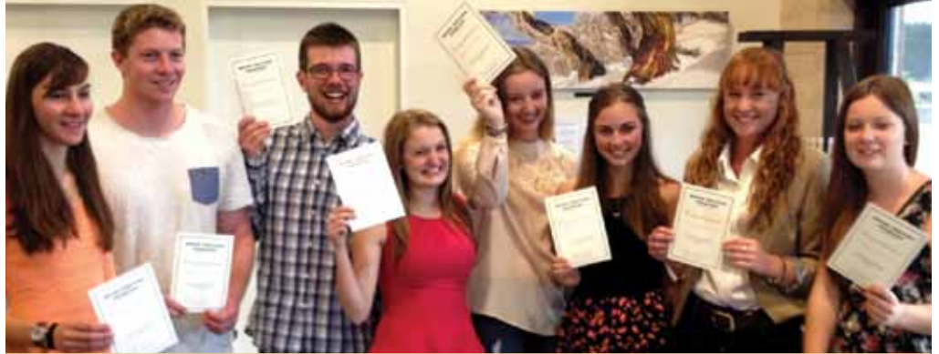
Congratulations to the 2015 Monaro CEF grant recipients

We're supporting students in a huge range of pursuits including agribusiness, engineering, plumbing, carpentry, veterinary