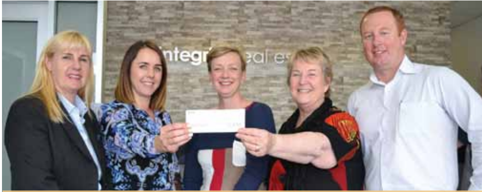
Volunteers from the Shoalhaven CEF receiving a cheque for the Scott Morrison Scholarship