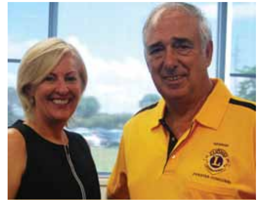
Forster Lions Club show their support