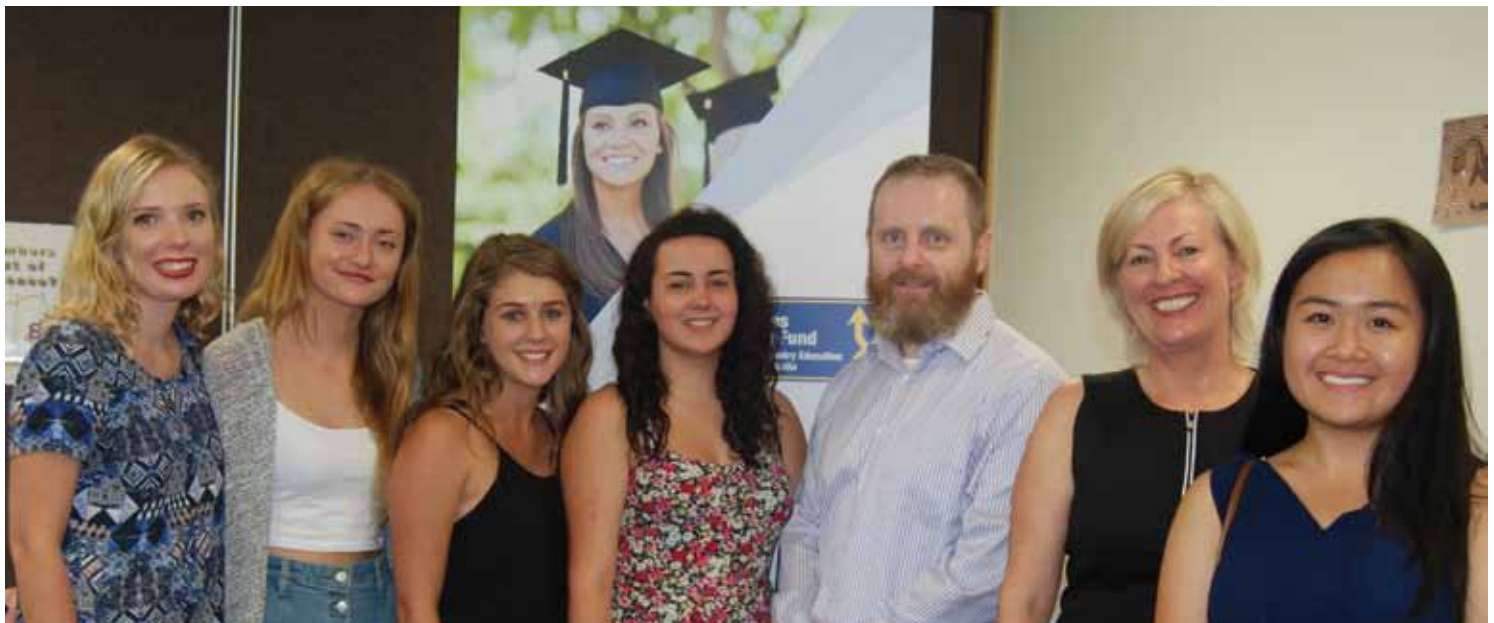
Meeting sponsors and students in Forster, NSW