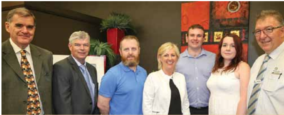
Meeting volunteers, sponsors and students in Port Macquarie, NSW

Since 2011 the Origin Foundation has provided over $600,000 to assist rural and regional students across Australia. Their support has helped us change many lives. CEF volunteers and students showed their appreciation in February when they welcomed Origin Foundation