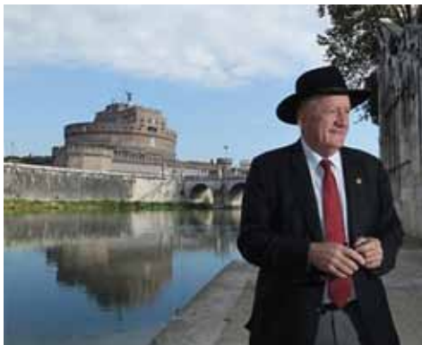
Tim with the recognisable Akubra beside the Tiber

CEF Ambassador, The Hon Tim Fischer AC, has generously committed to donating a percentage of the proceeds from sales of his latest book, Holy See, Unholy Me , to assist our work in rural Australia.