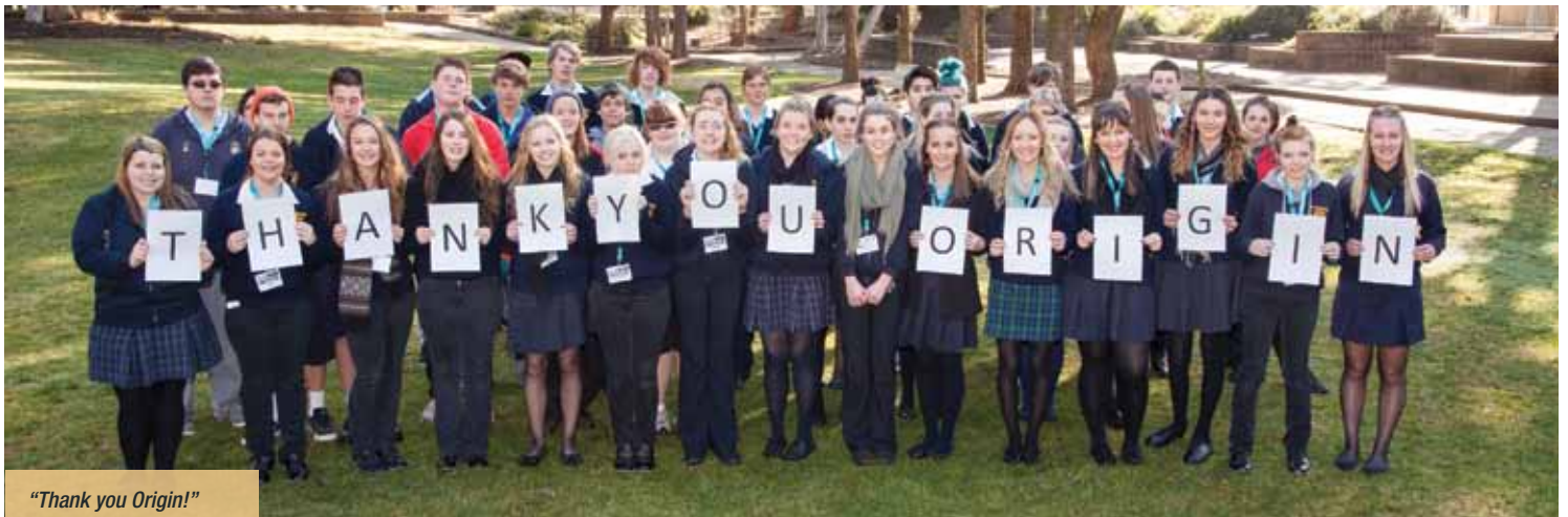
"Thank you Origin!"

A big thank you to the Origin Foundation which also helped make this experience possible.