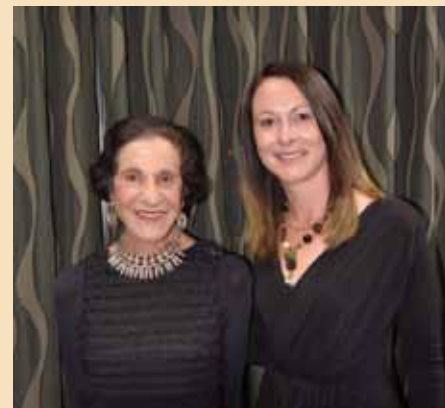
Marie Bashir at the Edward River fundraising dinner

Thank you to all who attended and to the businesses who supported the evening with sponsorship and auction items. Nearly $5000 was raised to help future students from the Edward River region.