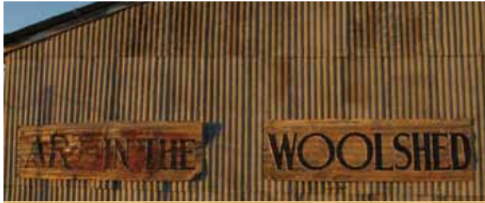
The Goulburn CEF's 2014 Art in the Woolshed fundraiser Right: One of the stunning artworks

For more information on how you can support the CEF call us on 02 6362 3162 or visit www.cef.org.au