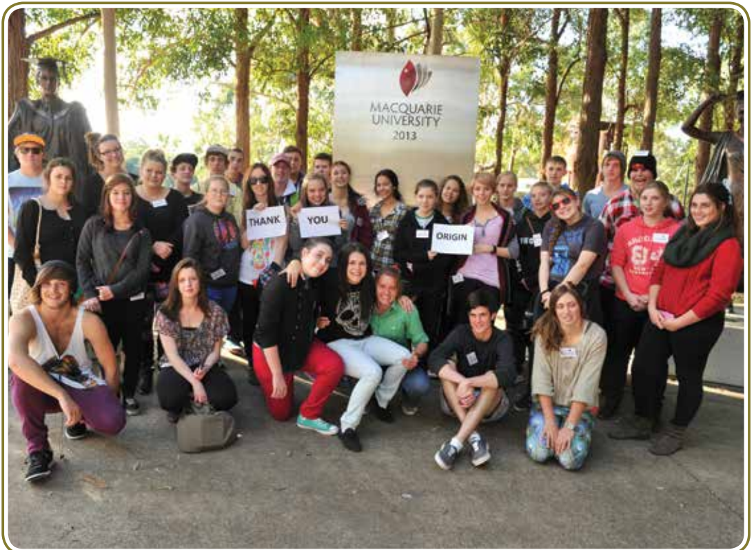
CEFA Students experience life at Macquarie University