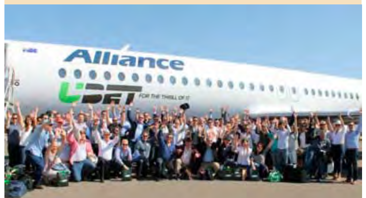
Business leaders at this year's City2Bush fund raising event.

What do you get when 100 city-dwelling business leaders land a plane in Longreach? A great day out at the races and a whole lot of fund raising. This year's City2Bush, sponsored by UBET, injected more than $100 000 into drought-affected communities in Queensland, with four CEF committees named amongst the beneficiaries.