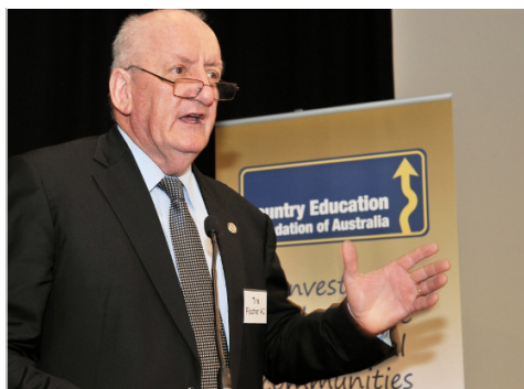
Hon. Tim Fischer AC is celebrated as CEF Patron.

During the course of this year, Tim was instrumental in establishing our first Victorian foundation, CEF Warracknabeal and gave his time to assist in the launch.