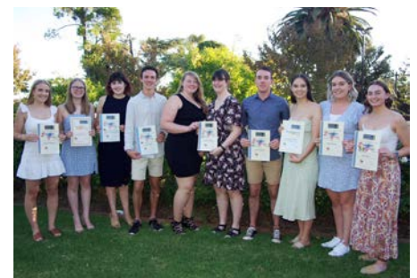
KAPUNDA HS CENTENARY FOUNDATION