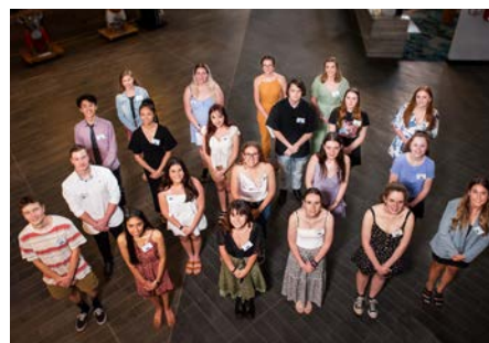
HASTINGS EDUCATION FUND