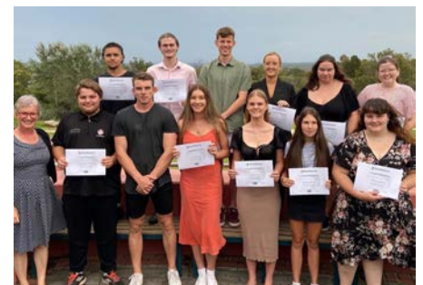
SHOALHAVEN EDUCATION FUND