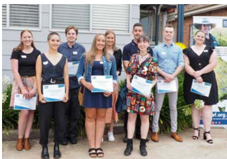
CEF ORANGE & DISTRICT