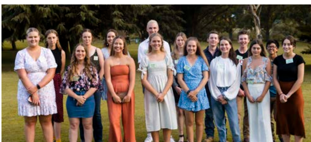
BRAIDWOOD & DISTRICT EDUCATION FOUNDATION