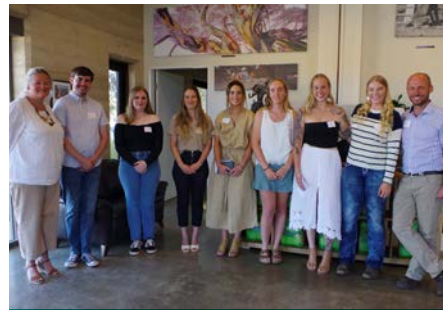
CEF SNOWY MONARO