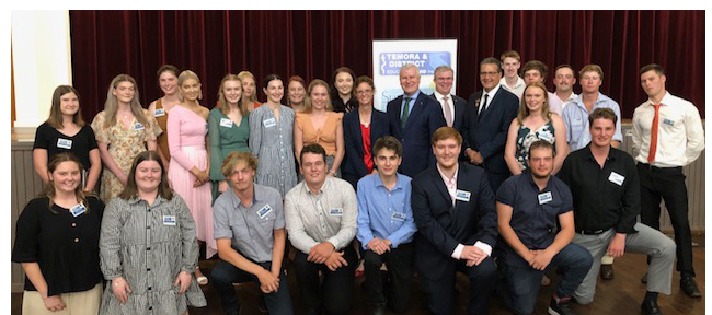
TEMORA & DISTRICT EDUCATION FUND