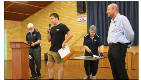
CEF COLEAMBALLY-DARLINGTON POINT

Final grant numbers for 2021 will be announced in the coming months.