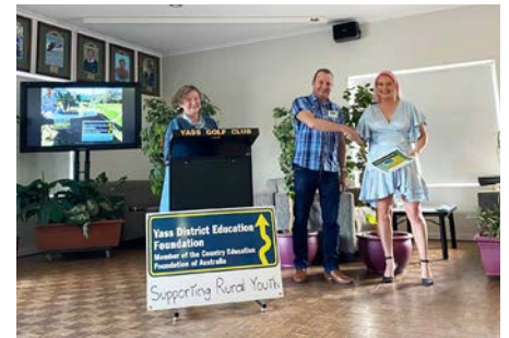
YASS DISTRICT EDUCATION FUND