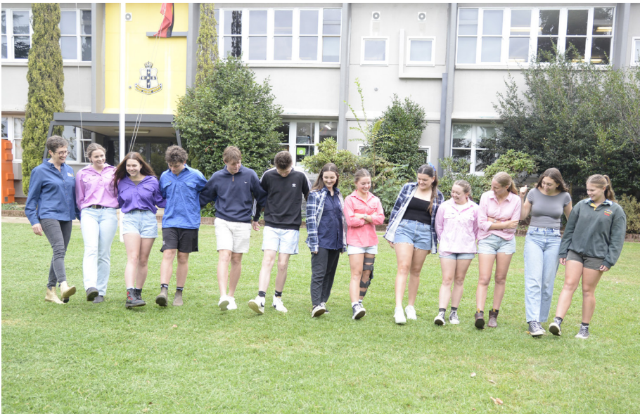
Students at Orange High School show off their boots during its Boot Bash event, a mufti day, on Friday 15th March.

Over 30 events were held by workplaces, schools and universities during the inaugural CEF 'Boot Bash' campaign, raising much needed awareness of the work CEF does in addressing the post-school education participation gap that exists between rural and regional youth and their metropolitan peers.