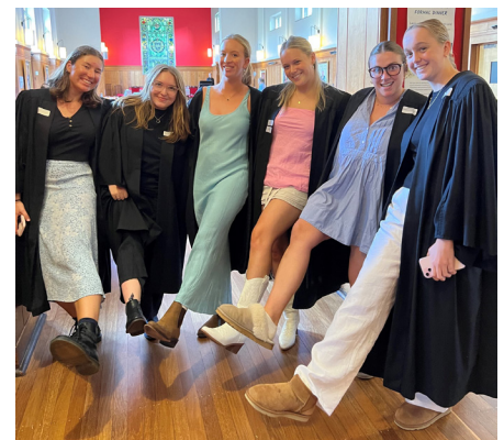
Sancta Sophia College got behind CEF by wearing their boots for a formal dinner.