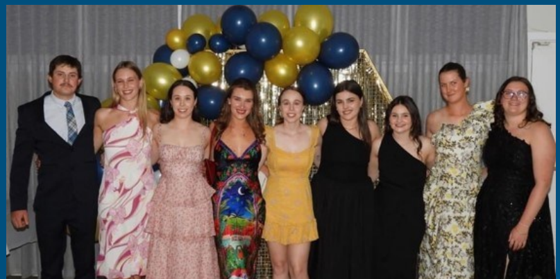
CEF Grenfell students and alumni at Grenfell Spring Ball