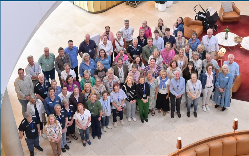
National Conference attendees