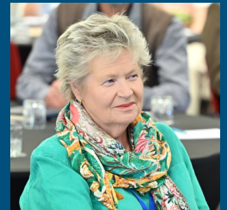
Mardi Chartres Edward River