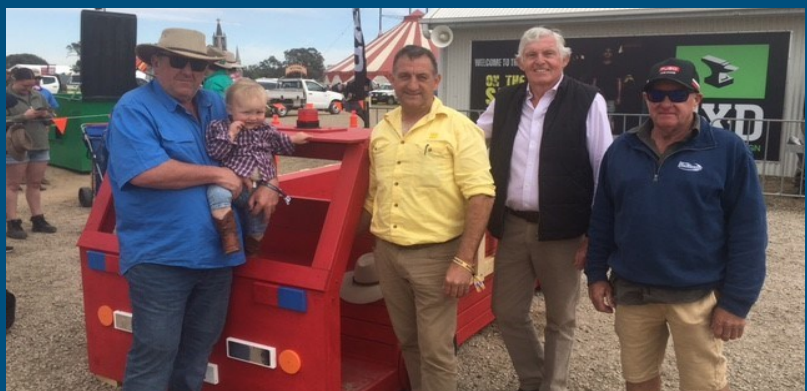
Edward River committee members at the Deni Ute Muster with the award winning entry in the Tradie's Challenge

We are extremely grateful for the unwavering support from donors from across the country with these funds directly benefitting students to open doors to their educational pursuits in 2025.